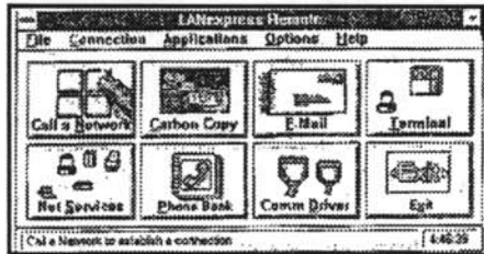
Premium Remote Client Software provides an easy-to-use interface for non-technical users.

Introducing LANexpress 2000—the new, easy-to-use, high-performance remote LAN access solution from Microcom, with the easiest setup of any remote LAN access product. You get tangible results just minutes after you open the box. It's easy to use, too—you can access e-mail or use any network services with one quick user-customizable click. What's more, LANexpress can be used for either dial-in or dial-out requirements.