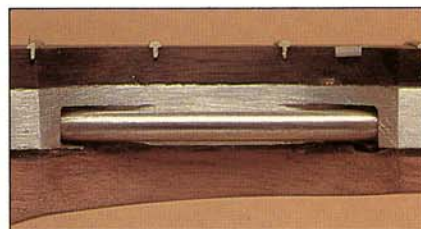
Magnesium U-channel in the neck.

Alvarez Regent guitars are economy models — excellent straightforward guitars without extra cosmetic touches. They all have the adjustable U-channel/steel rod reinforcement, and they all have genuine inlaid sound hole decoration, unlike some other brands which have decals.