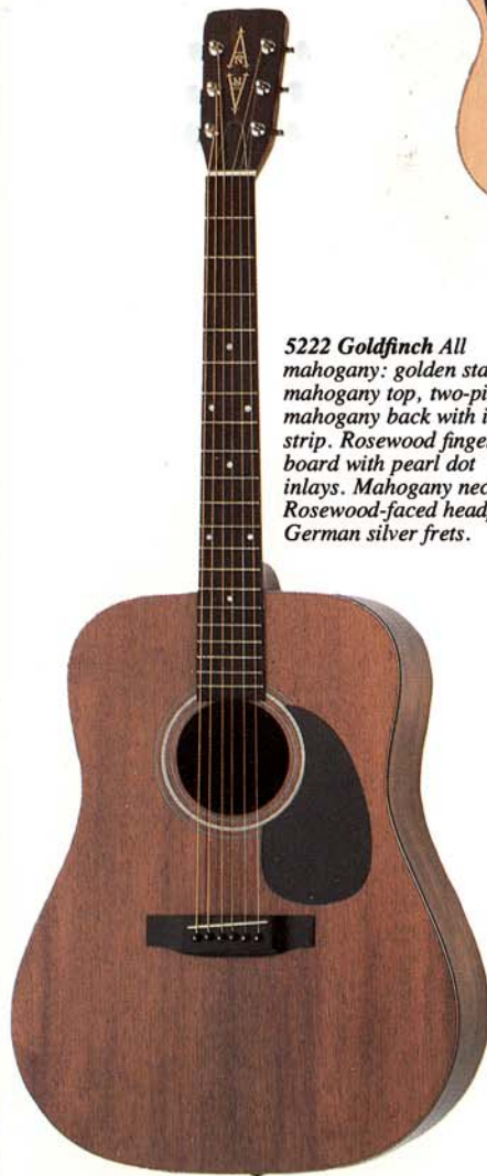
5222 Goldfinch All mahogany: golden stained mahogany top, two-piece mahogany back with inlay strip. Rosewood fingerboard with pearl dot inlays. Mahogany neck. Rosewood-faced headpiece. German silver frets.