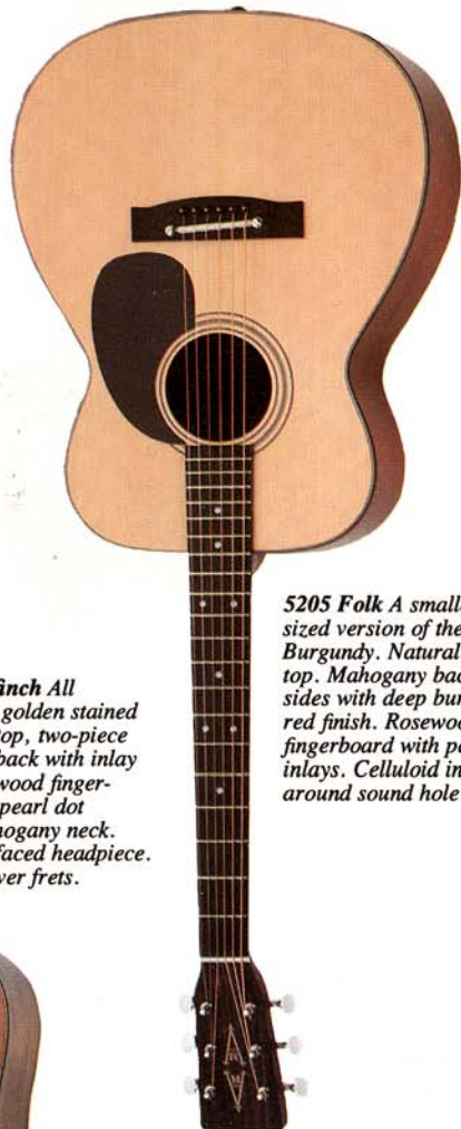
5205 Folk A A smaller-sized version of the 5225 Burgundy. Natural spruce top. Mahogany back and sides with deep burgundy red finish. Rosewood fingerboard with pearl dot inlays. Celluloid inlays around sound hole.