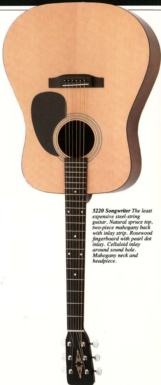
5220 Songwriter The least expensive steel-string guitar. Natural spruce top, two-piece mahogany back with inlay strip. Rosewood fingerboard with pearl dot inlay. Celluloid inlay around sound hole. Mahogany neck and headpiece.