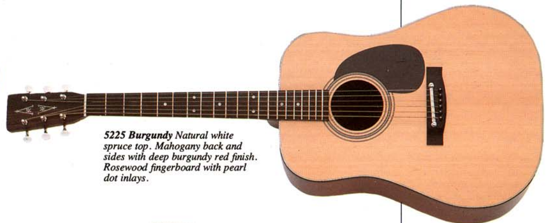
5225 Burgundy Natural white spruce top. Mahogany back and sides with deep burgundy red finish. Rosewood fingerboard with pearl dot inlays.