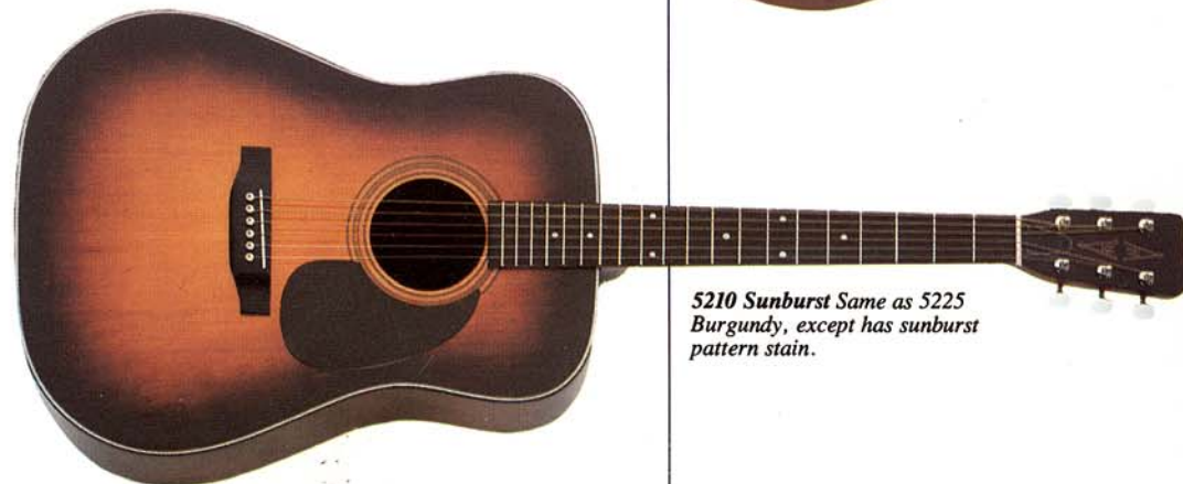
5210 Sunburst Same as 5225 Burgundy, except has sunburst pattern stain.