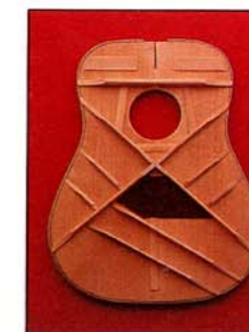
Symmetrical X bracing pattern for "dreadnought" style guitars.

Sor was the first and only guitarist invited to perform with the London Philharmonic in its first 100 years. When Sor made his London debut in 1815, nobody could believe that such magical and surprising effects could be produced on the guitar. Indeed, there was suppressed laughter when he first came on stage – laughter that soon changed into unbounded admiration when he began to play.