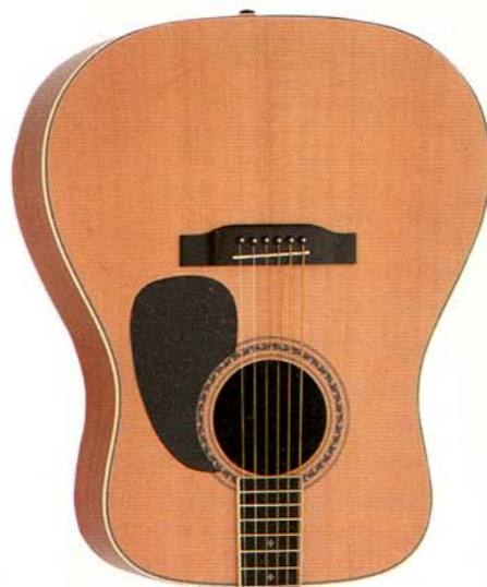
5065 Cajun Solid Canadian cedar top. Cedar is a more porous wood and gives a softer sound. Mahogany back and sides, rosewood fingerboard with pearl snowflake inlays. Jacaranda-faced headpiece.