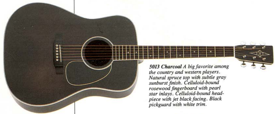
5013 Charcoal A big favorite among the country and western players. Natural spruce top with subtle gray sunburst finish. Celluloid-bound rosewood fingerboard with pearl star inlays. Celluloid-bound headpiece with jet black facing. Black pickguard with white trim.