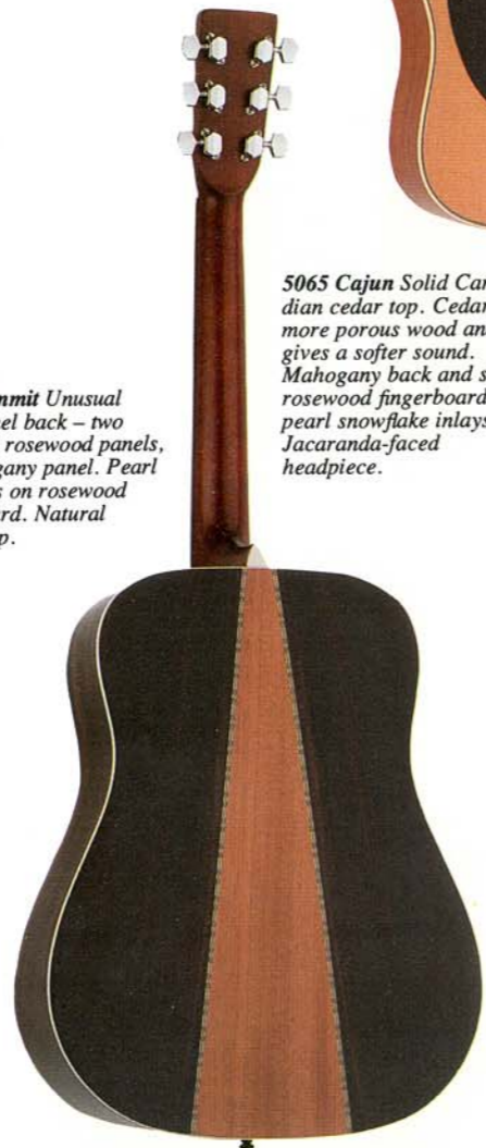
5043 Summit Unusual three-panel back – two V-shaped rosewood panels, on mahogany panel. Pearl dot inlays on rosewood fingerboard. Natural spruce top.