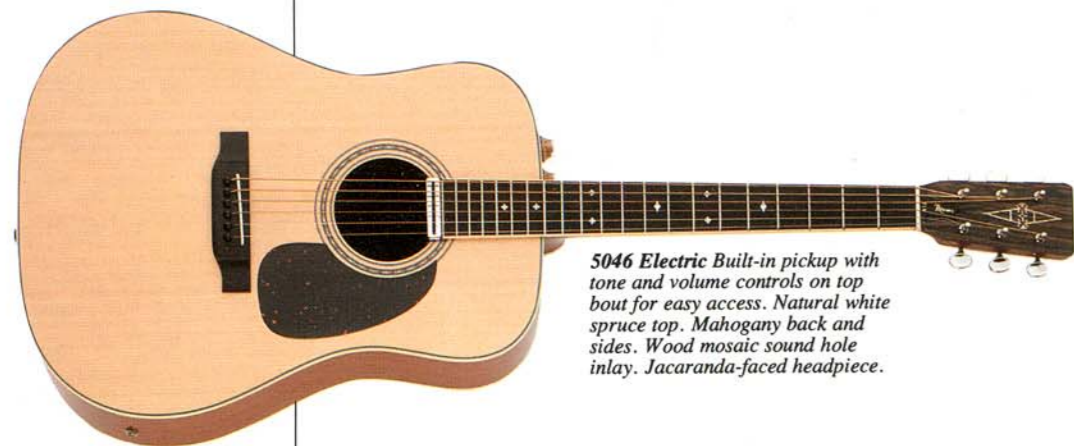
5046 Electric Built-in pickup with tone and volume controls on top bout for easy access. Natural white spruce top. Mahogany back and sides. Wood mosaic sound hole inlay. Jacaranda-faced headpiece.